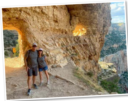
Faith and I enjoyed exploring the Grand Canyon

Though we'd been there in 2006, the breadth and beauty of the canyon never gets old. Every stop and overlook is postcard perfect. I will certainly go back again. □