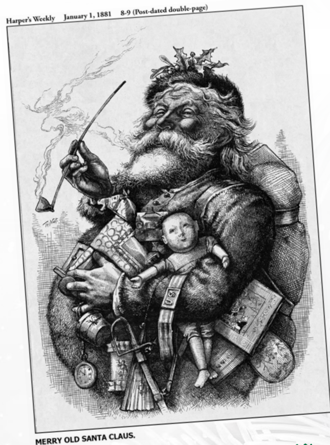
A Thomas Nast Santa, from 1881

While Nast was a pioneer in establishing Santa's red suit, Coca-Cola's advertising campaigns in the 1930s helped solidify the look. Some forty years later artist Haddon Sundblom created images of Santa in a red robe with a white beard for Coca-Cola ads. Sundblom's work standardized Santa's appearance to Nast's earlier drawings. □