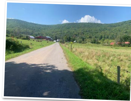
The Catskill Mountains