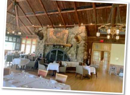
Bear Mountain Inn

After descending 437 feet, I saw a sign: Road Closed Ahead. Bicyclists Must Turn Around.