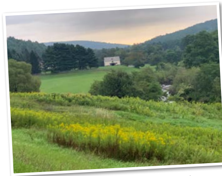
Grand Gorge, New York

The final night had me at Bear Mountain Inn with the next day being a 56-mile ride along the west side of the Hudson River, across the George Washington Bridge (GWB), down the west side of Manhattan and over the Brooklyn Bridge. It was fabulous with one exception.