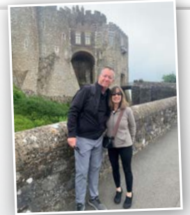
Faith and I at Dover Castle